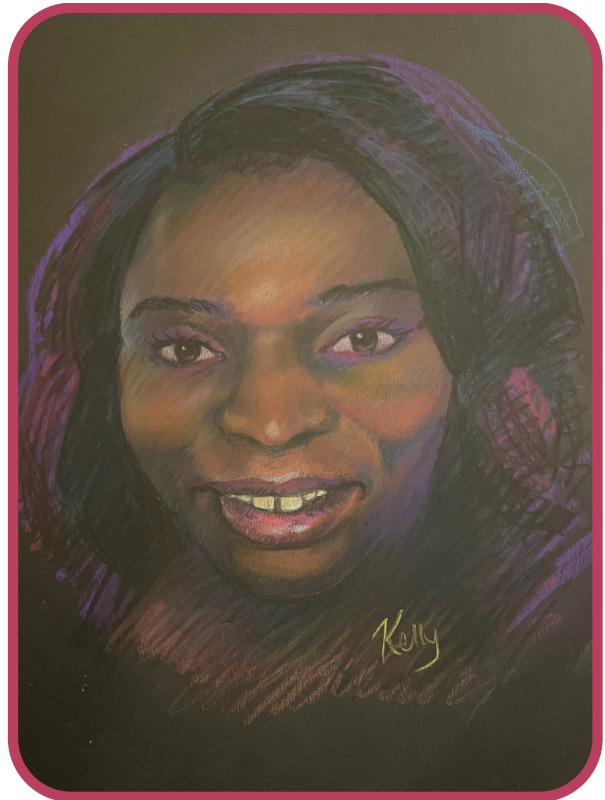
Artist's rendering identifying as female