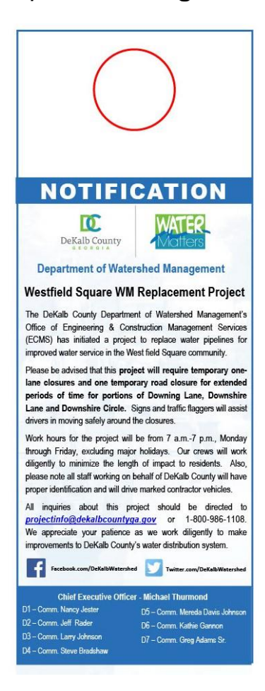
Sample 1. Door Hanger

The PCOS shall be notified twenty-four (24) hours in advance of any door hanging activity by the Contractor.