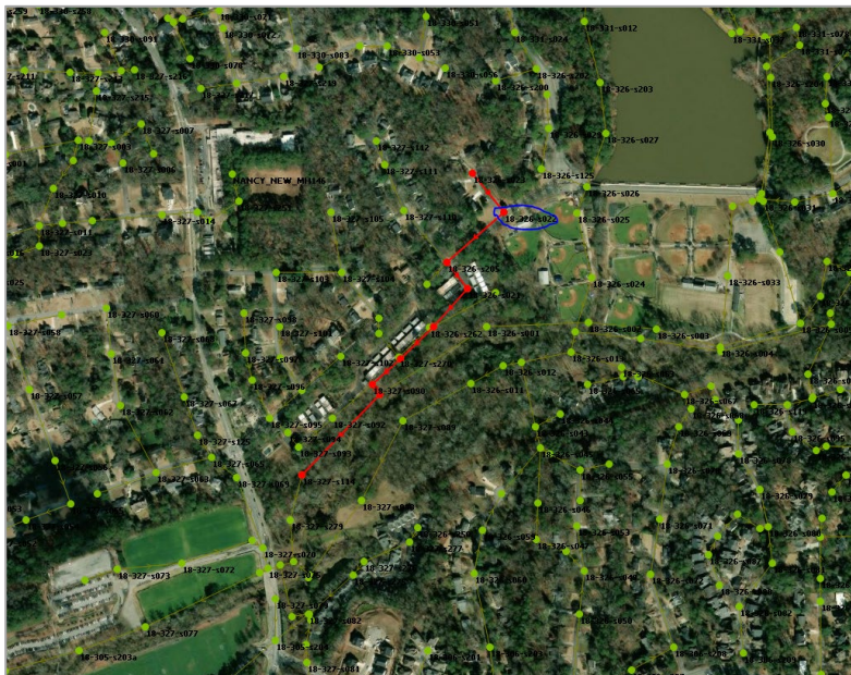
Hydraulic Model Profile for MH 18-326-s022

Found a 12(in) sewer main spilling into the creek due to a structural defect. (WO- 24023369)